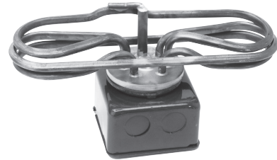
Specifications and Ordering Information